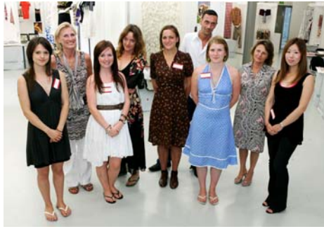
Texprint 2006 Judges and Special Prize winners